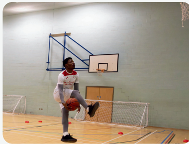
Our Public Services & Sports students hit the courts to take part in football, basketball and badminton during their sports day.