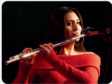
Our Music Performance & Music Technology students ended 2025 on a high, delivering an incredible live-streamed show at our annual event, Pitched!