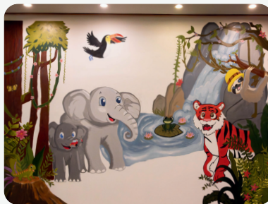
Our Art & Design students showed fantastic teamwork and creativity while designing and painting a vibrant mural for the Trinity Community Project at RAF Halton, gaining valuable real-world experience.