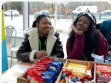
Health & Social Care students hosted a successful Thrift & Thrive sales morning at our Aylesbury campus to raise vital funds for the Stoke Mandeville Spinal Research - Life After Paralysis Charity.